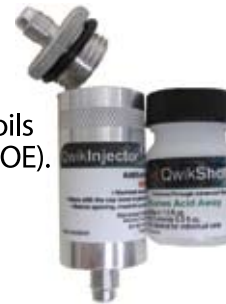
QT2510 / QT2500