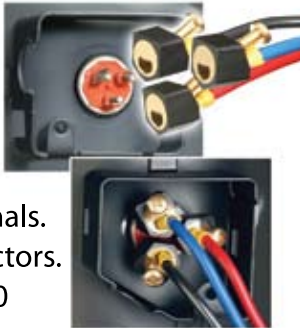
QT2810 / QT9210 QT2182 / QT2912